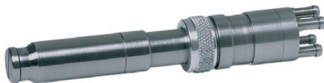
WA 81, The "Pipe Crawler"

Available nozzle sizes: 0.5 / 1.0 / 1.5 mm Ø